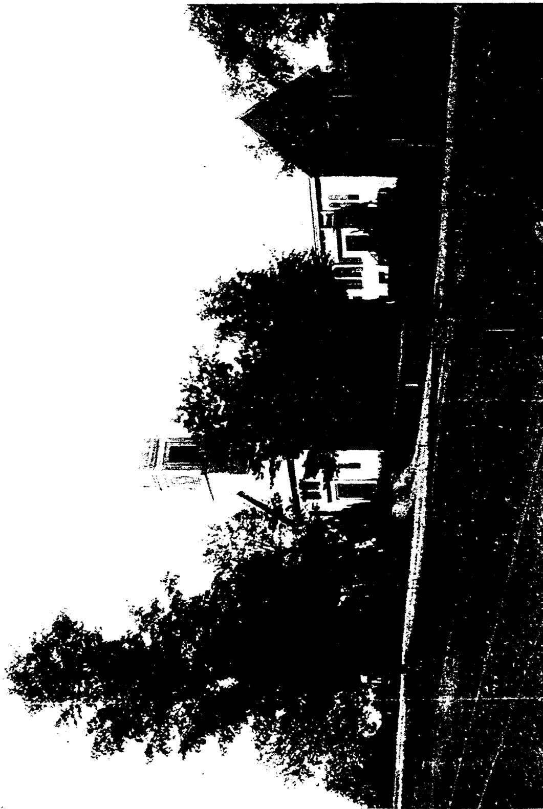
CONGREGATIONAL CHURCH, NEWINGTON, IN THE REAR OF WHICH IS THE GRAVEYARD