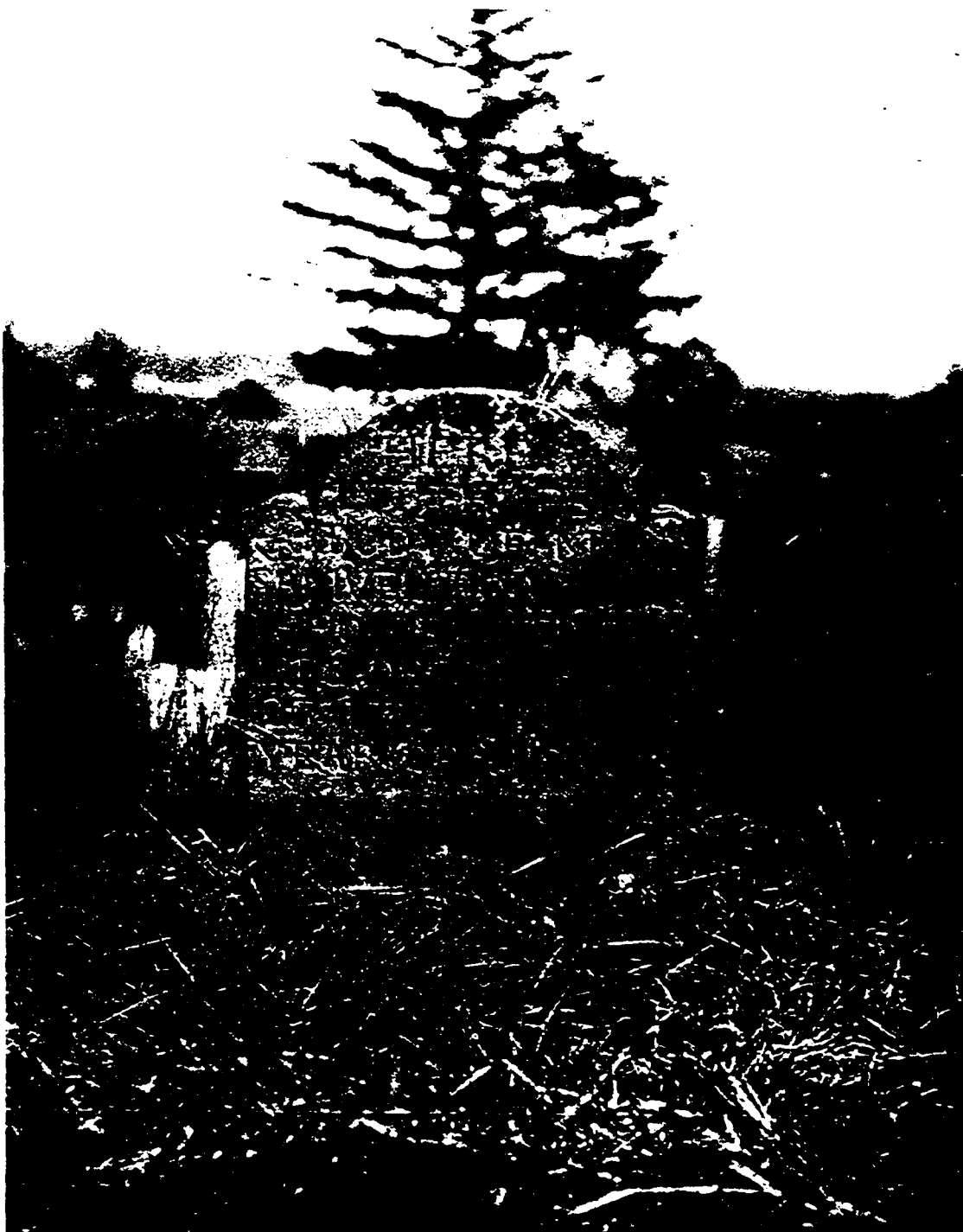
TOMBSTONE OF SAMUEL BORDMAN.