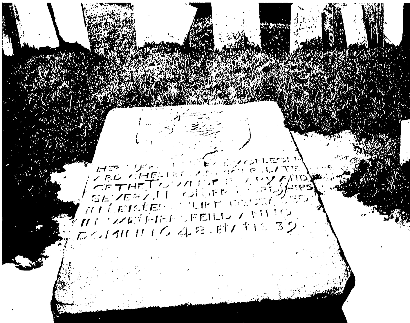
THE "LEONARD CHESTER" TABLE-STONE, SHOWING THE INSCRIPTION.