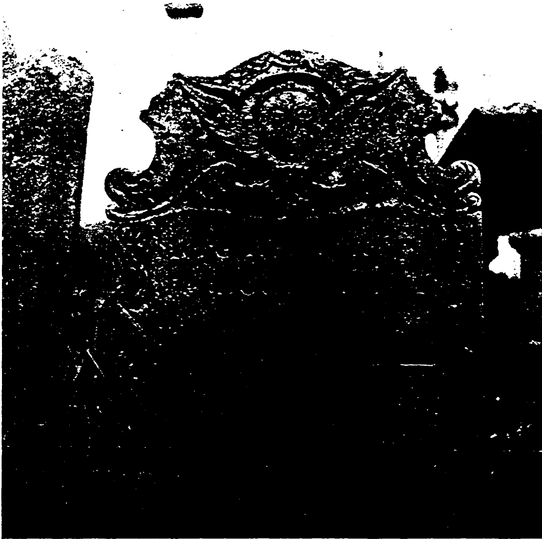
TOMBSTONE OF ABIGAIL (COLLINS) WOICOTT.